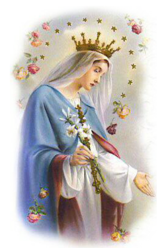
Office of the Marian Apostolate MARY, THE MOTHER OF GOD

msgrmangan@sfcatholic.org (605) 521-0175